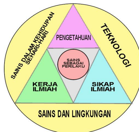
Figure 2. To the framework of Natural Science Development

The development of the SMA/MA Physics Curriculum is carried out in order to achieve the dimensions of knowledge competence, scientific work, and scientific attitudes as daily behavior in interacting with society, the environment and the use of technology, as illustrated in Figure 2. Below: