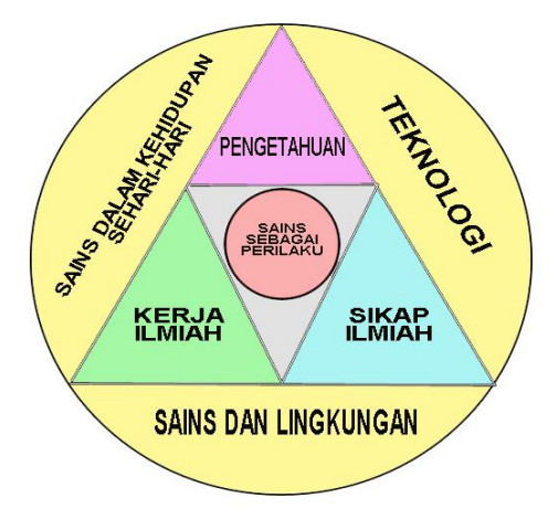
Figure 2. To the framework of Natural Science Development

The development of the SMA/MA Physics Curriculum is carried out in order to achieve the dimensions of knowledge competence, scientific work, and scientific attitudes as daily behavior in interacting with society, the environment and the use of technology, as illustrated in Figure 2. Below: